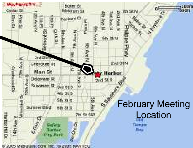
February Meeting Location

Please note that the featured marque at this year's Amelia Island event is Alfa Romeo. Unique Alfas from all over the world will be displayed, including some from the Alfa museum in Italy. Most of us plan to attend the Auction on Saturday and, of course, the "Concours d' Elegance" on Sunday. For more information about the Amelia Island event, check their web site.