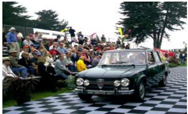
at Concorso Italiano

If you would like to provide additional club support, get a few perks, or have an active spouse member that would like to vote also, here's your chance.