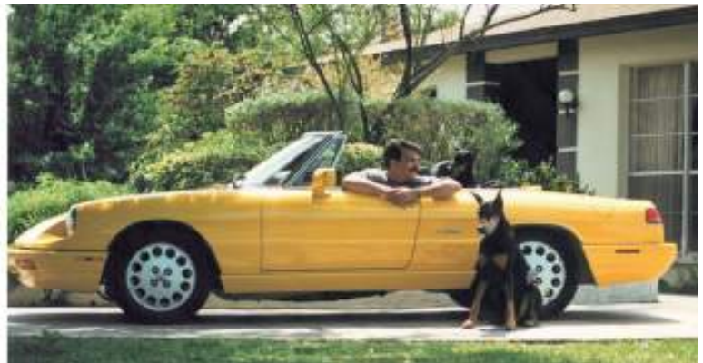
Echo, on the back shelf in 1994

FOR SALE: For Sale: 1988 Veloce Spider, red with tan interior. 73,918 milage. New clutch and transmission, new donut and throw-out bearing. $6,500 Call 678-770-0429 or 678-859-5609. E-mail: jccollins@adt.com