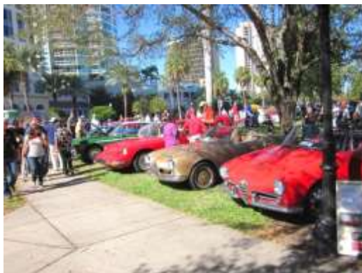
Alfa Romeo was the marquee at the 2011 St Petersburg Vintage Motor Classic.