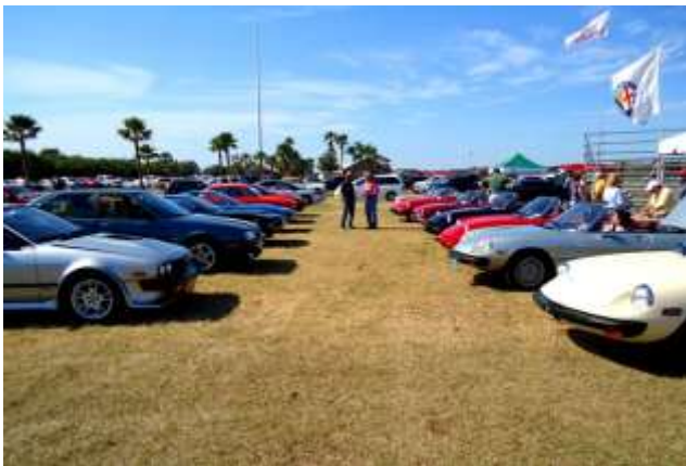
Two of the three rows of seventeen Alfas and Fiats lined up for display at the Sarasota Polo Club in typical January, Florida weather.