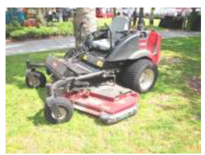
Right in the middle of the show was this Toro Groundmaster 7200 mower chained to a tree. Trophy time!