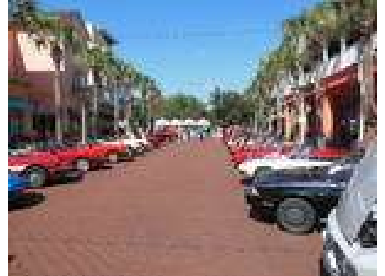
Market St empties out for lunch in the bistros and boutiques behind the cars.