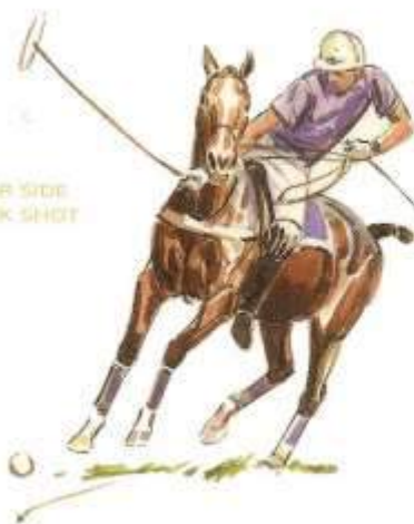
NEAR SIDE NECK SHOT

The shaft is made of bamboo cane with a hardwood head. The head is beveled on one end to allow a full swing flush to the ground. The mallet is highly flexible and varies in length.