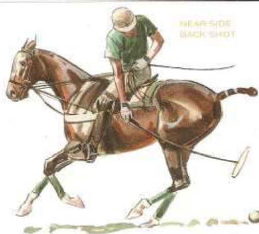
NEAR-SIDE BACK SHOT