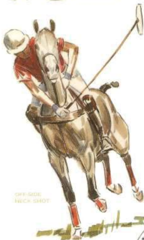
OFF-SIDE NECK SHOT

Two mounted umpires on the field consult each other after each infringement and impose a penalty only if they agree. If they do not agree, they confer with the third man or referee. They also monitor safety for the players and horses.