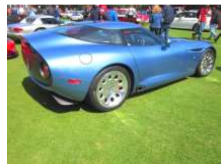
This is a true wrap around rear window !

Carla picked the color when, they decided to have the car built, she looked up and said, "I want it to be the color of the sky !" And it is, "Azzurro !"