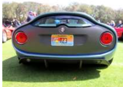
Great hindsight is provided by the See through cortina. FL license "TZ3."