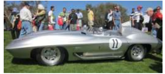
1959 Stingray concept