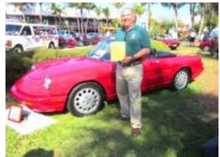
We sat twenty at the table for

lunch at the club's favorite, Café L'Europe, two others dined at their favorite Columbia and two remained in the circle and