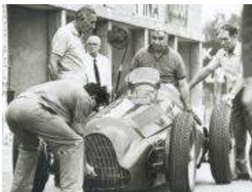
Fangio getting in an Alfaf