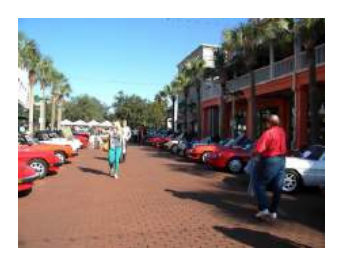
Lunch time on Market Street in Celebration, FL. Over 65 Alfas & Fiats are parked on the bricks.