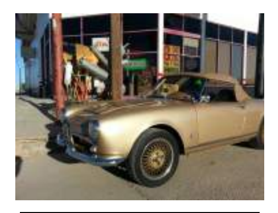
Palomas, MX. Those are mufflers for sale hanging on the telephone pole.