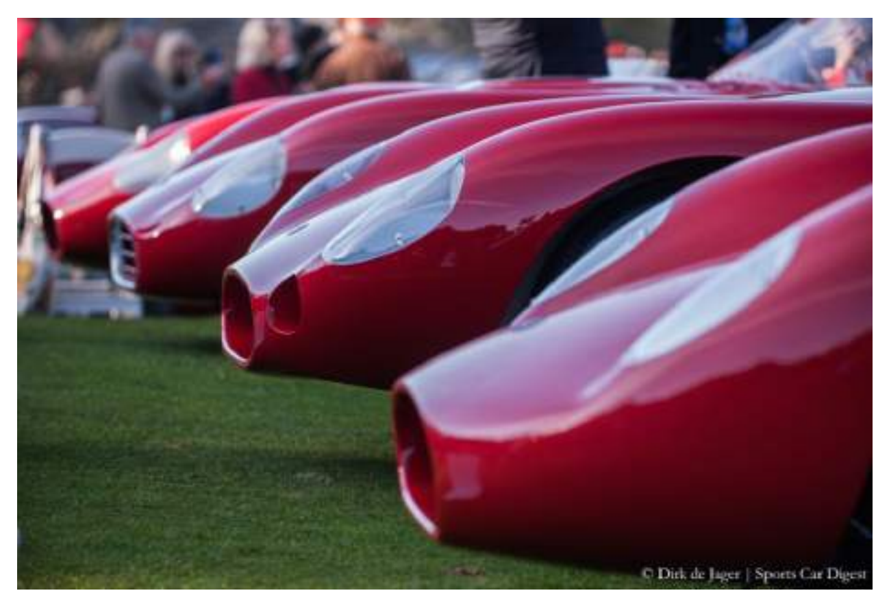
This Porsche won its class and is from Tampa!