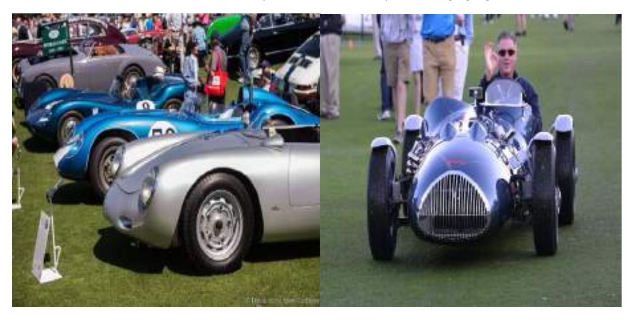
This is not your average gorgeous 1937 MG