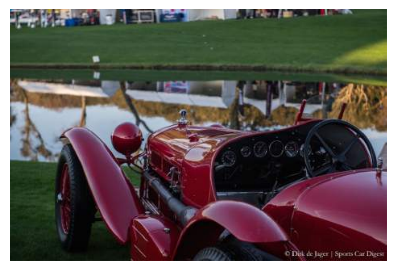
An Early morning scene as the cars come onto the green for placement at Amelia.