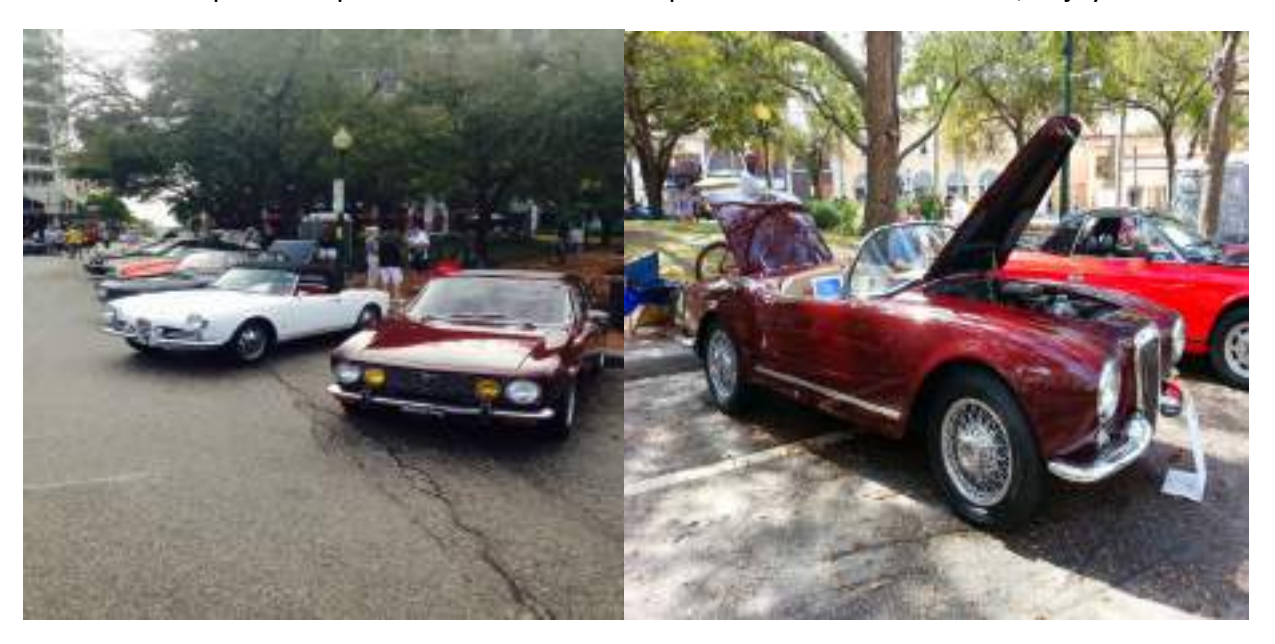
Harmon Heed's Lovely Car

Here are a couple more photos of our cars lined up at the Sarasota Car Show, enjoy!