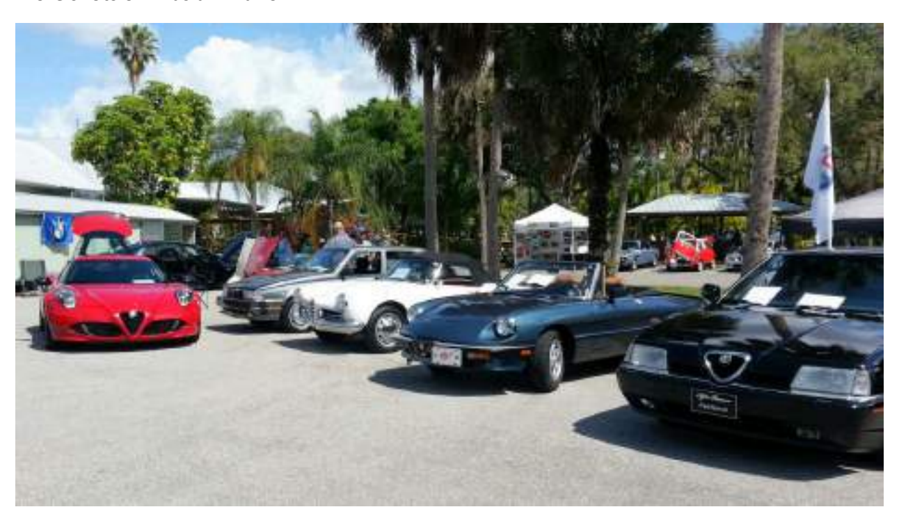
Even more Alfas of all vintages and colors