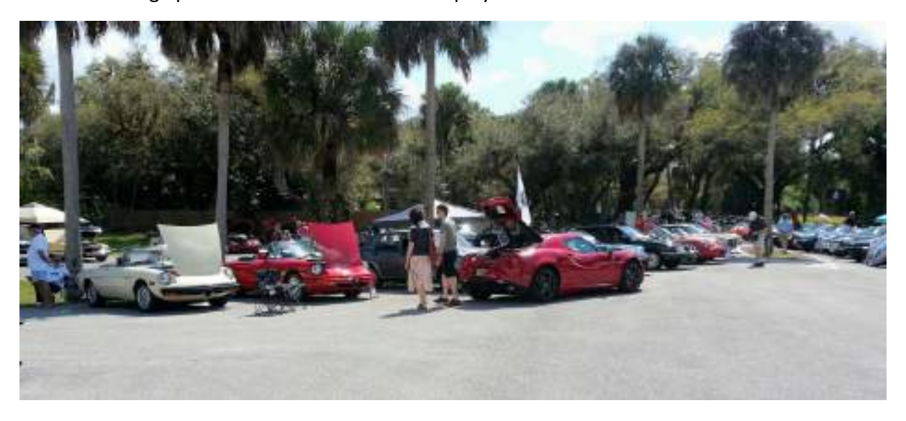
A rare green metallic GTV Junior purchased originally in Rome anchors the row or Alfas

Another vantage point of the row of Alfas on display