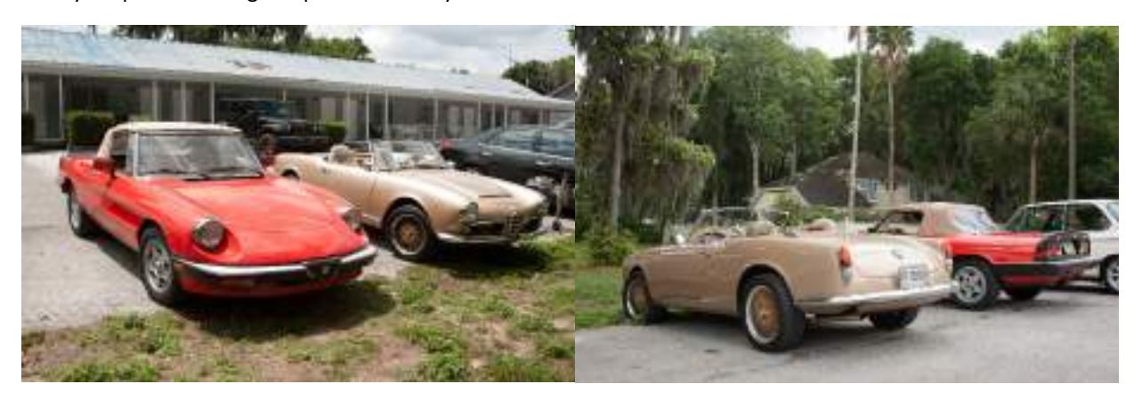
Finally a beautiful Grey Spider, always a good color combination on these cars.