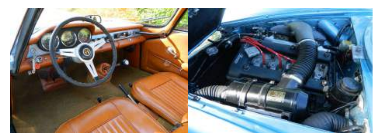
Another angle of this beautiful Sprint Speciale – Great Color too.