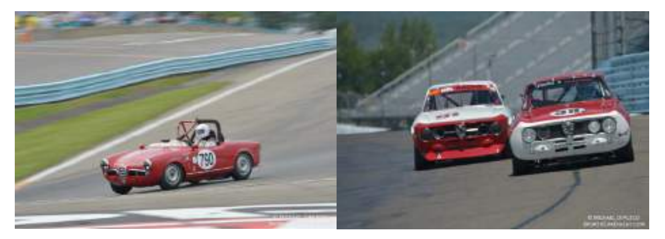
Alfas ruled the Glen.