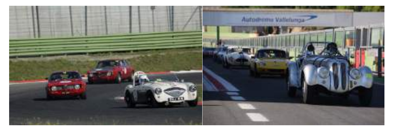
Show off your cars before the event – and what a place to do it wow, Rome in June!

Keep on driving and do not look in the rear mirror!