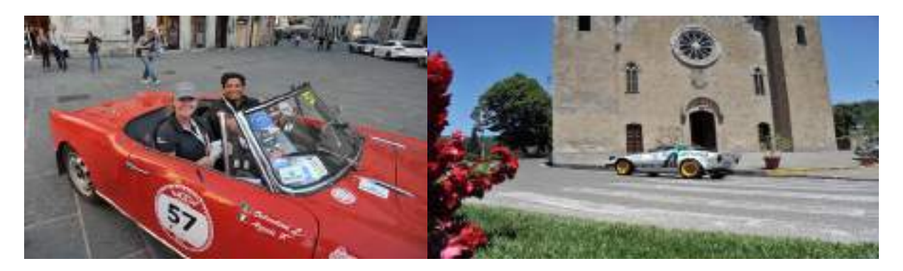
Father – Can we speed this along I am in a bit of a hurry!

Ladies this is the way to get an Italian vacation!