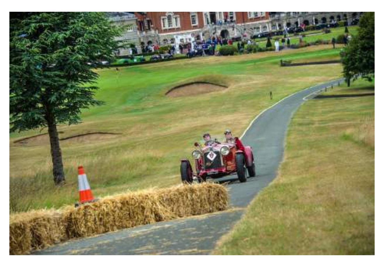
1928 Alfa Romeo 6C 1500 MM Supercharged enters Blenheim Palace