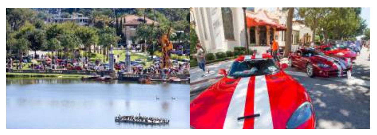
Sign up today using this link

With over 35,000 people attending, the Concour de Elegance located around the lake will host 125 cars fast becoming the prelude show to Amelia Island, with over 600 cars in the open car event located in the downtown streets. Cars are grouped by class and make on the streets with every vehicle imaginable.