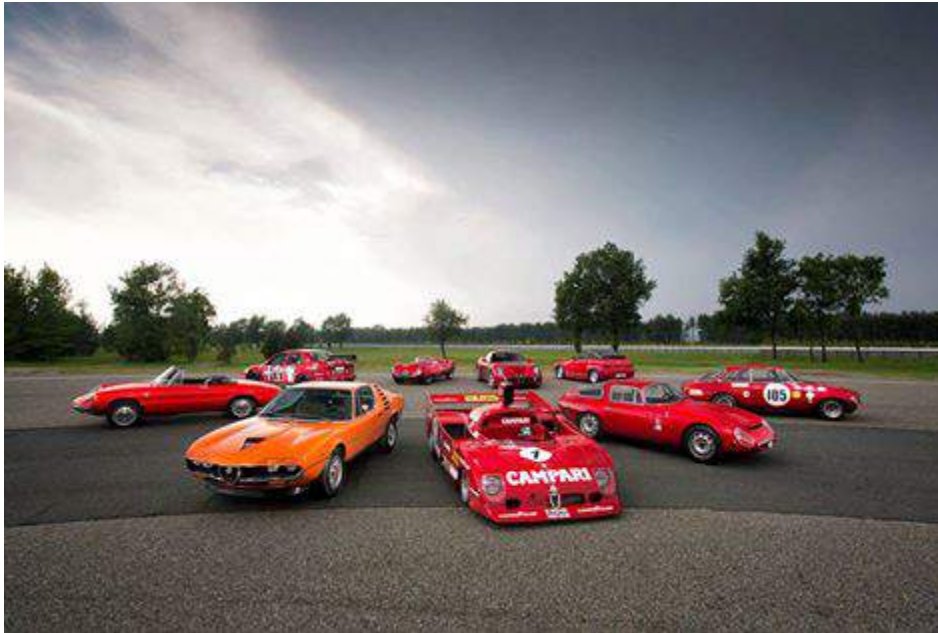
Alfa TZ1 through the new Zagato TZ3 Stradale

Interesting that the Montreal is the only one not in “Rossa” but what a collection!