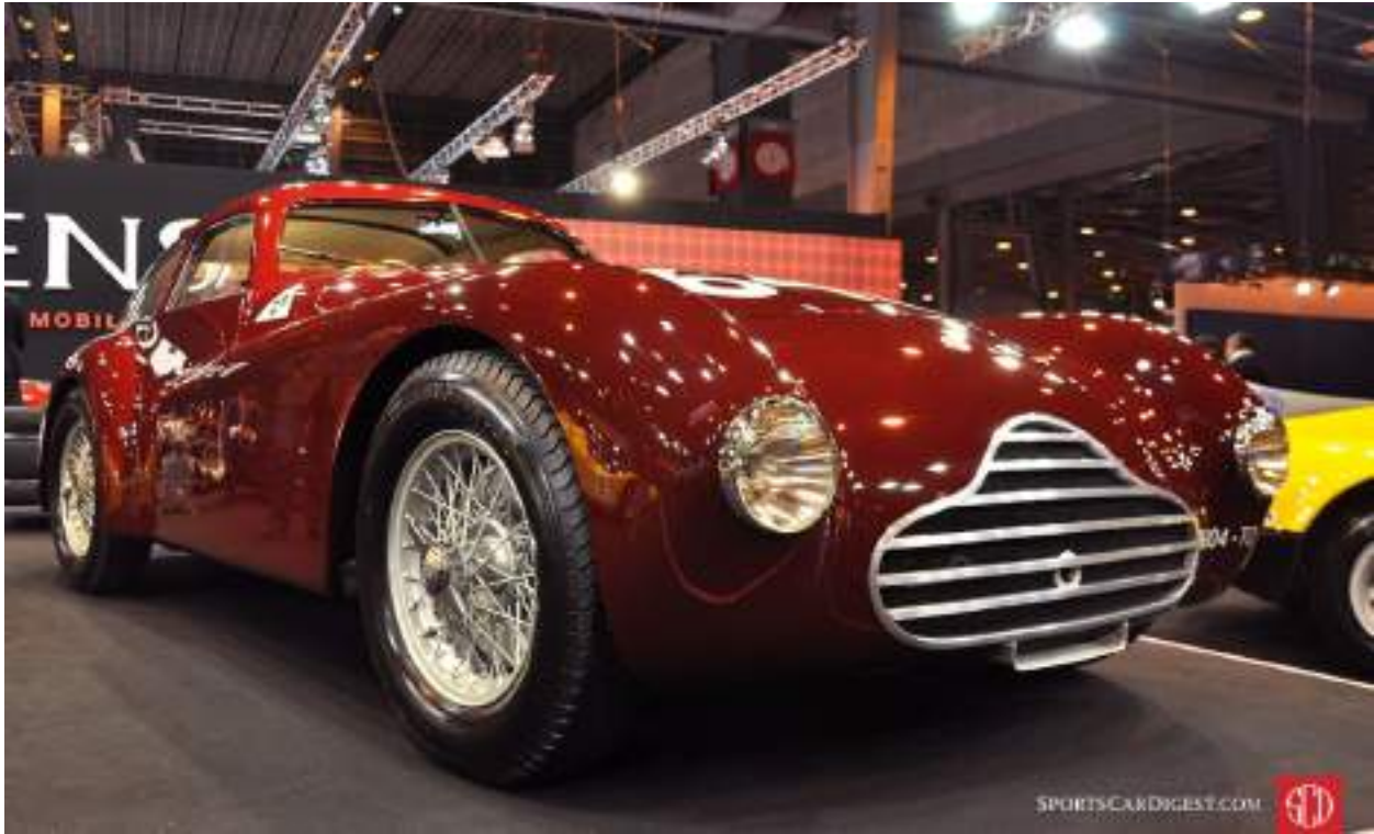
Alfa Romeo 8C 2900B Berlinetta – 1938