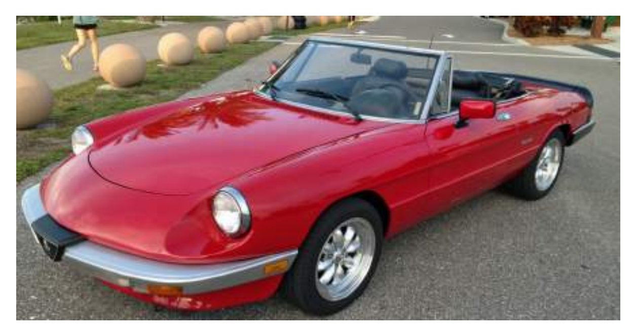
1991 Alfa Romeo Spider Convertible 5 speed manual Italian Sports Car - $9500 (Sarasota)

Contact Christian Giusti 749italc@gmail.com or 941-928-3819.