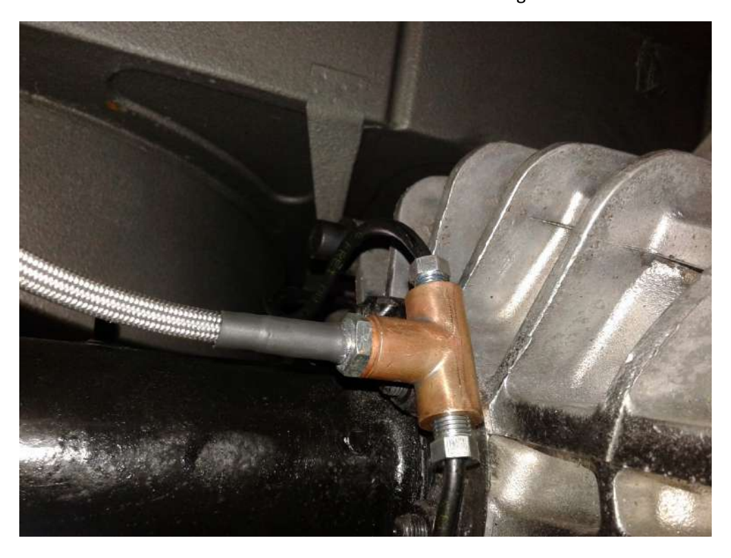
Larger rear disc brakes to go with new suspension

New Braided Stainless brake lines and fittings