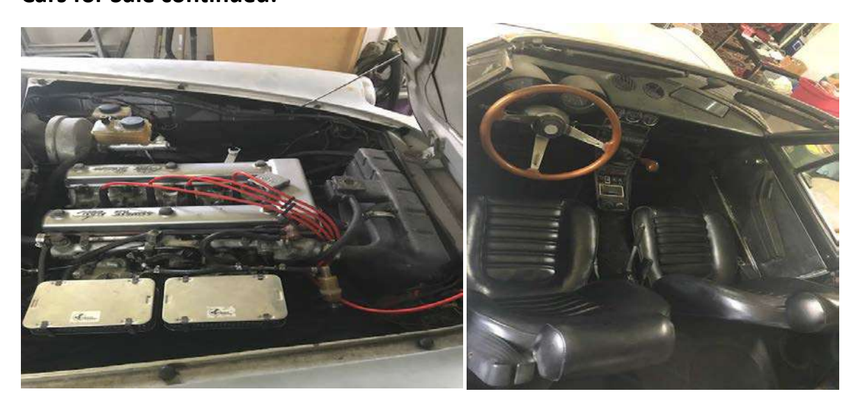
List your Alfa for sale here. It is free to all club members.