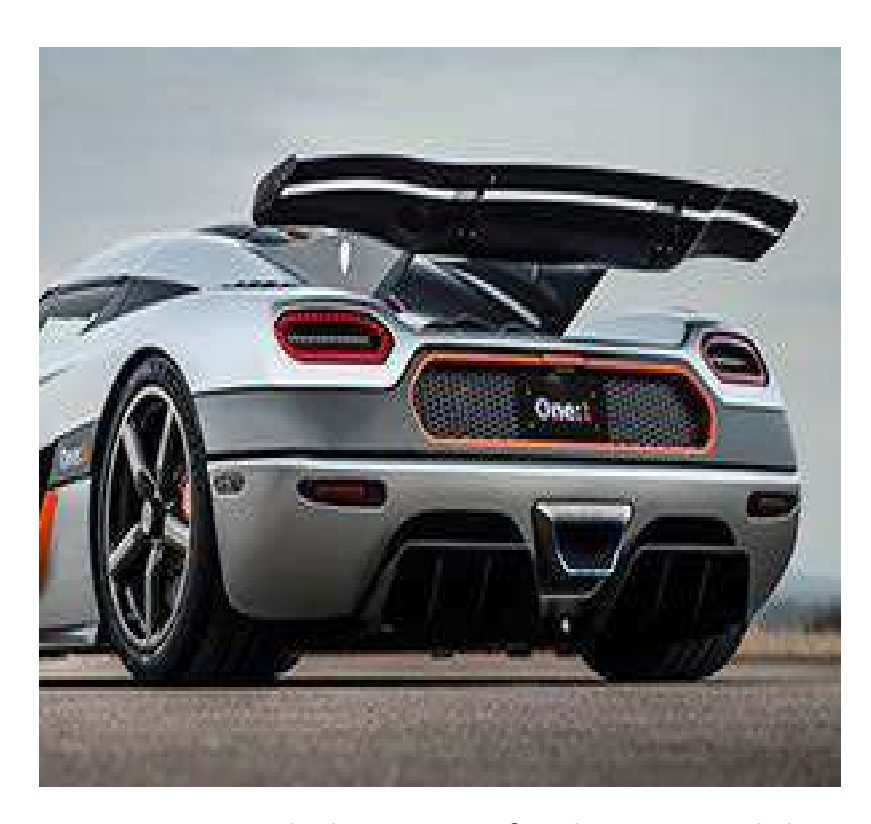
A Visit is worth the trip just for the cars inside!