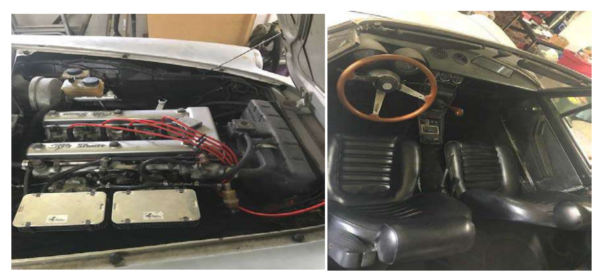
List your Alfa for sale here. It is free to all club members.