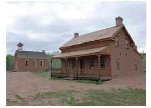
Figure 1 Grafton Ghost Town

Afternoon gathering for early birds at Steurer's home, 3095 E 2550 S, St George 6:30 to 9:00pm Dinner reception at Alfredo's Italian Restaurant, 110 S. Bluff, St. George