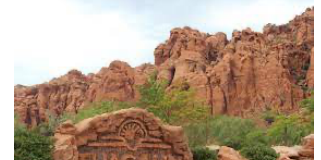
Figure 6 Tuachan

Oct 28 7:00 to 8:30 Breakfast at Parry Lodge hotel (included w/room) 8:30 Drivers Meeting Morning: 9:00 to 11:00 Drive to St. George and Tuachan 11:00 Tour Tuachan Lunch: 11:30 to 1:00 Lunch at Tuachan Cafe 1:00 to 3:30 Drive scenic Snow Canyon loop 3:30 Check-in to Inn on the Cliff, 511 Tech Ridge, St. George 4:00 to 6:30 Free time in St. George with list of activities 6:30 to 9:00 Awards Banquet at Cliffside Restaurant, 511 Tech Ridge