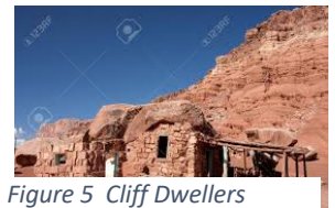
Figure 5 Cliff Dwellers