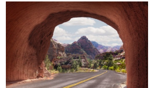
Figure 2 Zion Park Tunnels

Morning: 7:00 to 8:00 Breakfast at Abbey Inn hotel (included w/room) 8:00 Drivers Meeting 8:30 to 10:00 Drive to Rockville and Grafton 10:00 to 11:00 Visit Grafton cemetery & ghost town 11:00 to 11:15 Drive to Springdale Lunch: 11:30 to 12:30 Camp Outpost Restaurant, 709 Zion Pk Blvd, Springdale Afternoon: 12:30 to 2:30 Drive thru Zion Nat'l Park tunnels, Mt. Carmel, to Kanab, 2:30 to 3:00 Check-in hotel – Parry Lodge, 89 E Center, Kanab. Pick up keys and potty stop (rooms may not be ready) 3:00 to 6:00 Trucks leave for Peekaboo Canyon tour 6:00 to 6:30 Potty stop, purchase beer/wine for BYOB dinner Dinner: 6:30 to 9:00 Kanab Movie Fort Ranch – Cowboy outdoor dinner