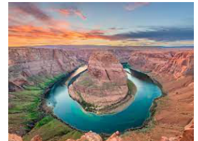
Figure 4 Horseshoe Bend

Morning: 7:00 – 8:00 Breakfast at Parry Lodge hotel (included w/room) 8:00 Drivers Meeting 8:30 to 9:30 Drive to Page AZ, Wahweep gate , Glen Canyon Nat'l Park 9:30 to 10:00 Wahweep , Lake Powell drive, view point #2 10 to 10:15 Maverick Gas Station - Pit stop gas and potty 10:15 to 10:30 Drive to Horseshoe Bend 10:30 to 11:30 ¾ mile hike Horseshoe Bend. ($10 per car parking fee) 12:00 to 1:00 Drive to Cliff Dwellers Lunch: 1:00 to 2:30 Cliff Dwellers Lodge Café, 1409 US-80A, Marble Cyn. Afternoon: 2:30 to 3:30 Drive to Jacob Lake 3:30 to 4:00 Pit Stop at Jacob Lake Inn (gas, potty, cookies) 4:00 to 5:00 Drive to Kanab 5:00 to 6:30 Free time in Kanab with a list of activities Dinner: 6:30 to 9:00 Iron Horse Restaurant, 78 E Center, Kanab