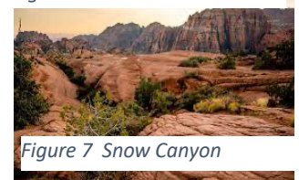
Figure 7 Snow Canyon