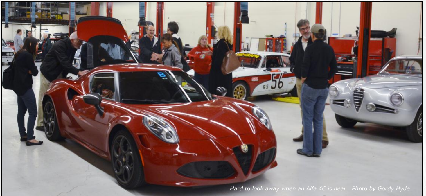
Hard to look away when an Alfa 4C is near.