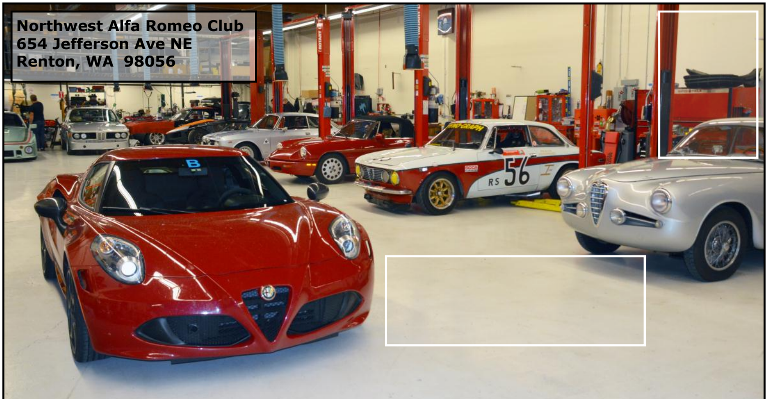
The beauty and diversity of the Alfas that greeted us at Group 2 Motorsports for our November visit.