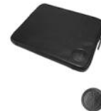
Alfa Romeo Leather Tablet Cover