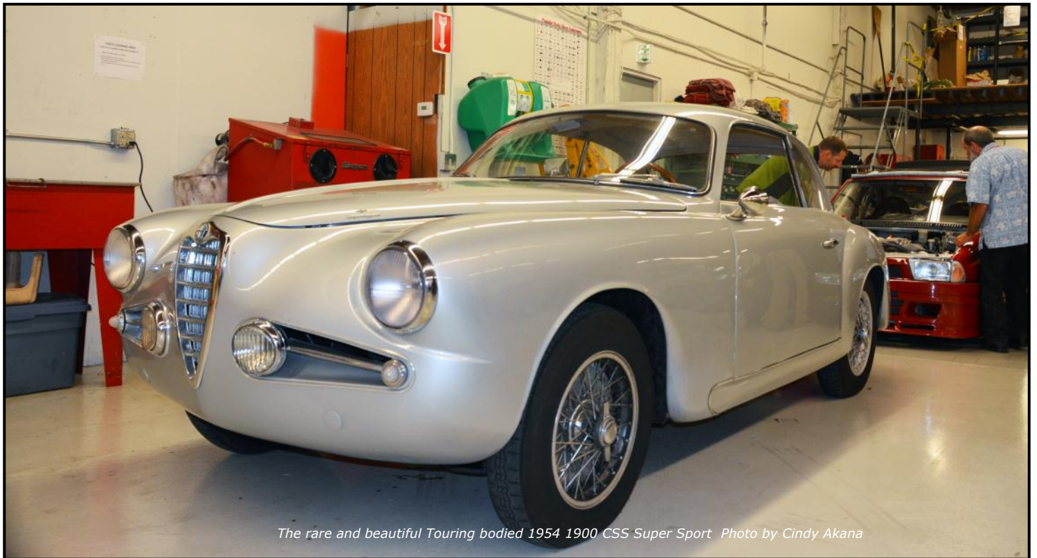
The rare and beautiful Touring bodied 1954 1900 CSS Super Sport