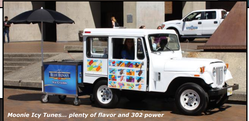
Moonie Icy Tunes... plenty of flavor and 302 power

Sharing cars, Seattle sunshine, good people, wonderful food trucks, and helping PAWS. It was a great way to spend a sunny Sunday.