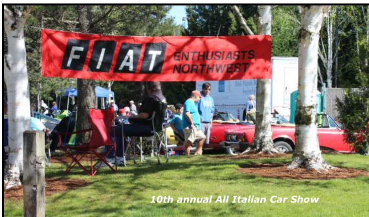
10th annual All Italian Car Show

The sun held out throughout the event and everyone appeared to love every minute of it. Thanks to the FEN crew for putting this together and to all the people who brought out the great cars.