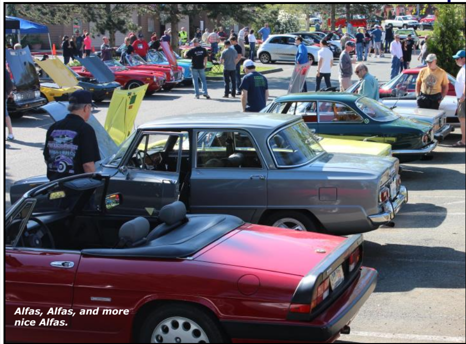
Alfas, Alfas, and more nice Alfas.

Perhaps setting an example for the whole year, Fiat Enthusiasts Northwest (FEN) put on their wonderful Italian car show at the Triple X Drive In in Issaquah to start the car show season. The weather was wonderful. Crowds were very good. The mix of cars is outstanding with Alfa Romeos, Fiats, Ferrari, Lamborghini, Detomaso, Lancia, Maserati, and few other odd Italian entries.