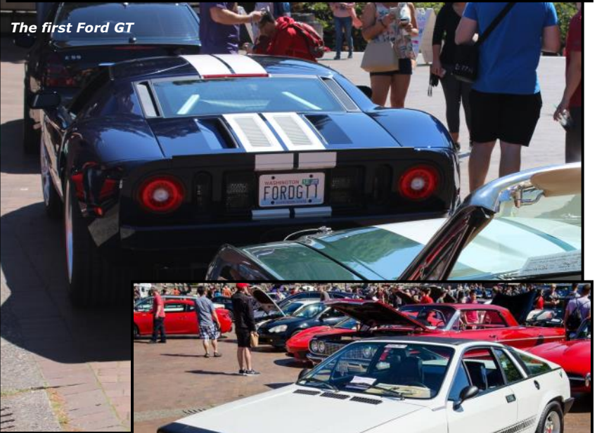
The first Ford GT