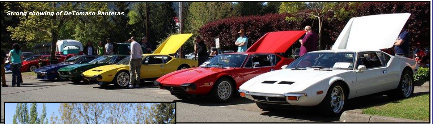
Strong showing of DeTomaso Panteras