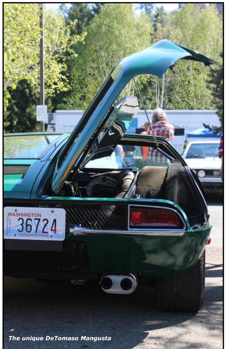
The unique DeTomaso Mangusta