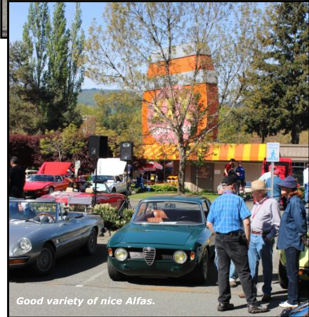
Good variety of nice Alfas.