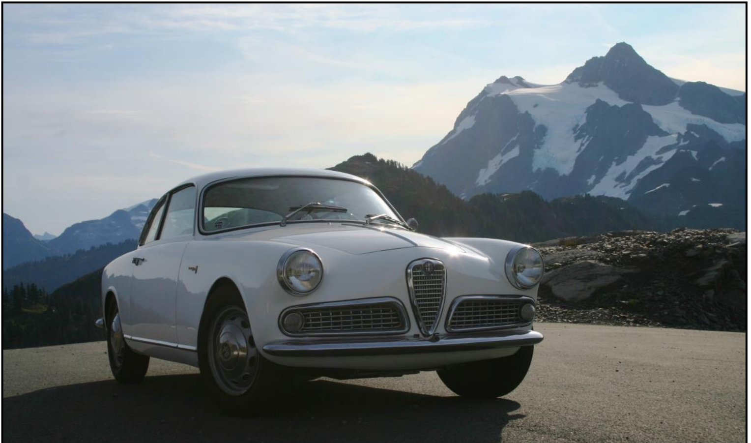
Giulietta Sprint Veloce on the Mt. Baker Scenic Hwy.