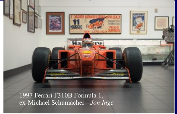
1997 Ferrari F310B Formula 1, ex-Michael Schumacher—Jon Inge