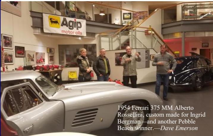
1954 Ferrari 375 MM Alberto Rossellini, custom made for Ingrid Bergman—and another Pebble Beach winner.