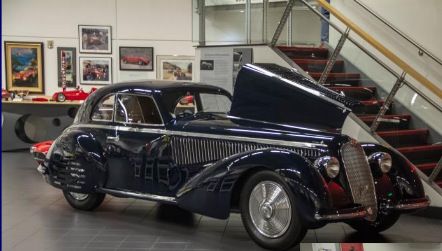
1938 Alfa Romeo 8C2900, a Pebble Beach winner.