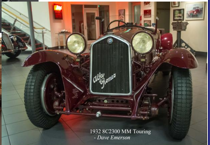
1932 8C2300 MM Touring - Dave Emerson